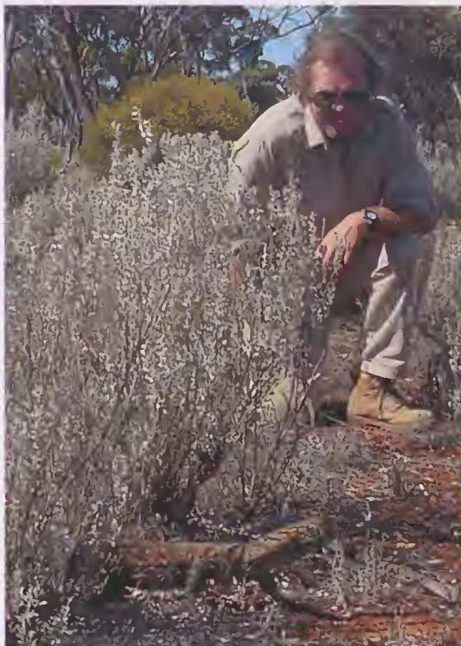
Figure 1. Varanus giganteus seen near the Aurora Range.

In addition to the above observations, Pianka (1994) reported seeing two V. giganteus crossing the road between Menzies and Leonora (30° 01'S 121° 10'E; 46 km S of Leonora). Ray Hart (pers. comm.) found a dead Perentie on the same road in this vicinity in December 2000, and Dell et al. (1988) reported a V. giganteus on Goongarrie station. Dell et al. (1985) reported sighting V. giganteus at Mt Jackson and Bungalbin Hill, indicating a range extension of approximately 100 km. Chapman and